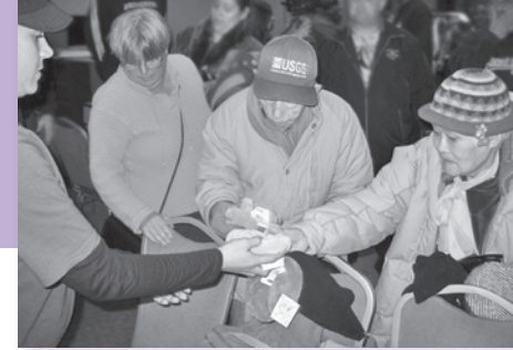
Thank you volunteers and the Reno Bighorns!

The Mission served more than 25,000 meals between Thanksgiving and Christmas.