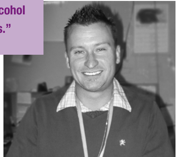
Thanks to so many caring people, God is transforming my life

"My relationship with God is now filling the holes in my life that I once filled with alcohol and other drugs."